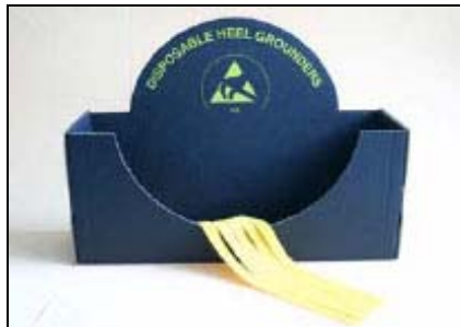
Disposable Heel Grounders